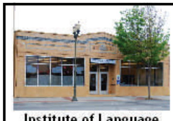
Institute of Language and Culture 320 Rodriguez Street Watsonville, CA 95076 (831) 786-8225