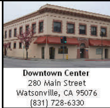
Downtown Center 280 Main Street Watsonville, CA 95076 (831) 728-6330