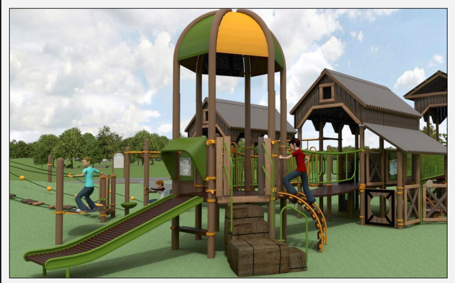
LEO's Haven, an accessible playground at Chanticleer Park, is now out to bid thanks to voter approval of Measure G.

We've always updating our awardwinning Citizen Connect app to give you access to anytime, anywhere services. Download Citizen Connect for iTunes and Google Play.