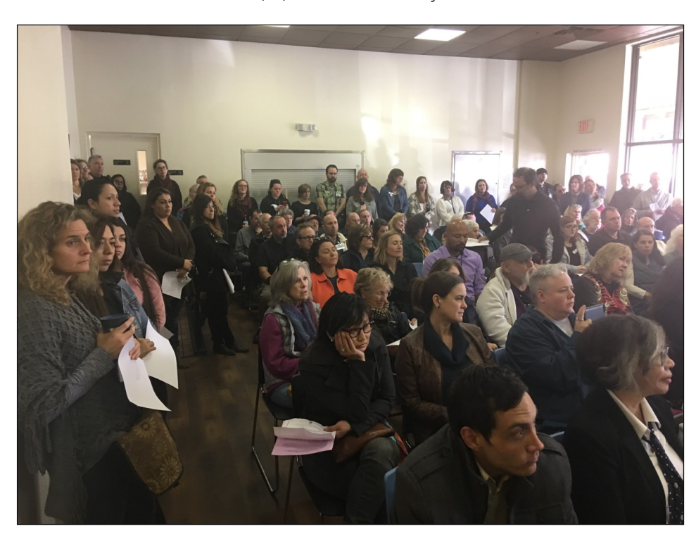
A crowd of homeless persons, advocates, elected officials, city and county officials and many other listen to speakers at the annual Homeless Memoria I Service.

Advocates hope to work with the Muse-Across the U.S., 19 million people ex- um of Art and History to establish a perience housing insecurity. Within permanent memorial at Evergreen