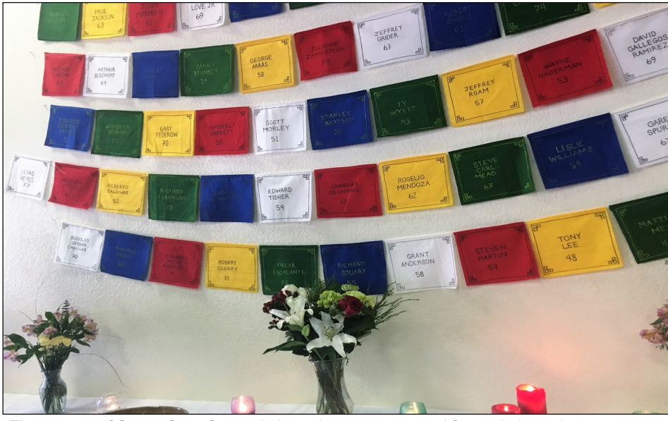
The names of Santa Cruz County's homeless persons and formerly homeless persons who passed away in 2018 are printed on flags, which are displayed at the Homeless Person Memorial, held annually at the Homeless Services Center.

California, the homeless population Cemetery.