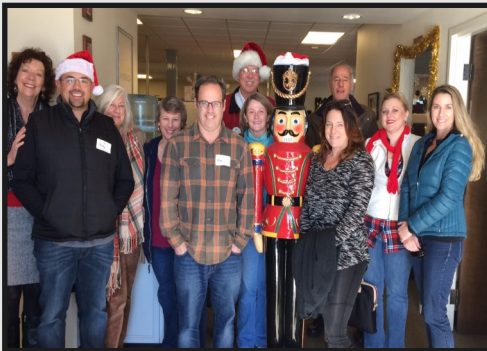
ANNUAL TRADITION: County supervisors and staff visited Second Harvest Food Bank on Dec. 16 to help sort food for the needy.