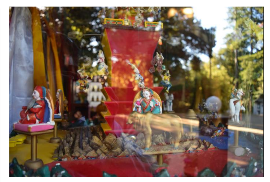
Santa Cruz County is full of wonders. Do you know where this oasis in the redwoods is? Find out more about us by following us on Twitter @sccounty, or like us on Facebook, www.facebook.com/CountyofSantaCruz. (Answer: Land of Medicine Buddha)

We've always updating our award-winning Citizen Connect app to give you access to anytime, anywhere services. <u>Download Citizen Connect</u> for iTunes and Google Play.