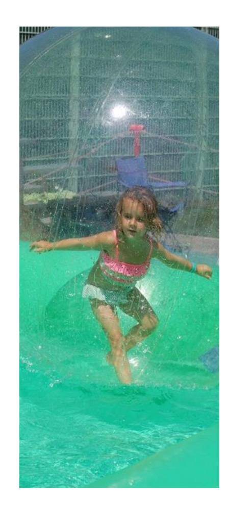
The 2016 Parks & Rex fundraiser at Simpkins Swim Center was a huge success, raising nearly $10,000 for children's programs and the Santa Cruz County Animal Shelter.

No details of the agreement have been released, but the Board of Supervisors is tentatively set to vote on the agreement on Oct. 11.