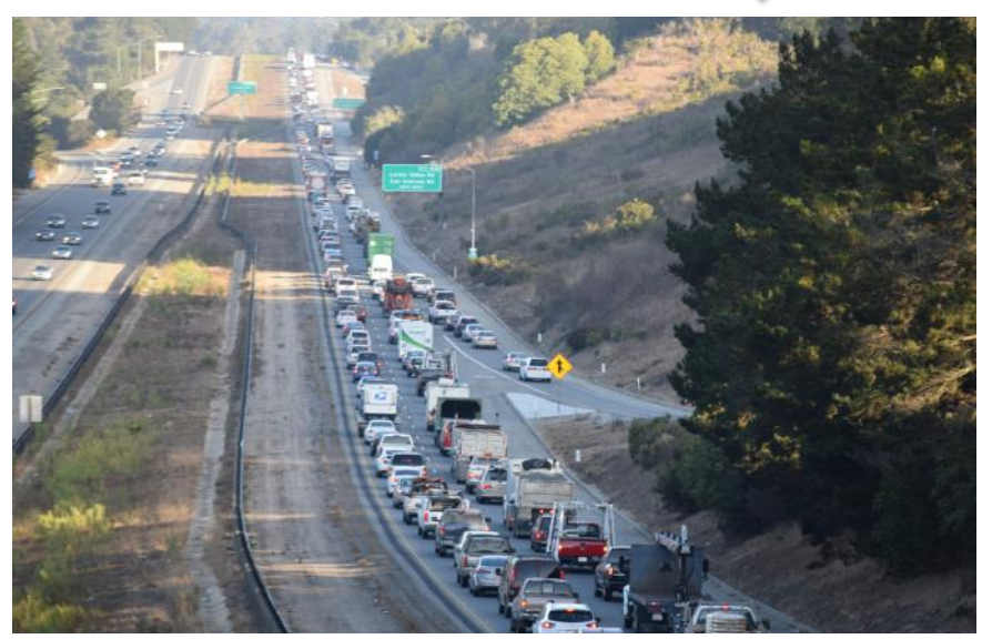
Nov. 8 may be one of the most consequential elections of our lifetimes, deciding not only the next president, but the fate of the death penalty, cannabis legalization and more. Locally, several key measures are on the ballot, including Measure D, which proponents say would improve the county's transportation system for bikers, walkers, drivers, public transit users, the elderly and the disabled. Learn more about Measure D at <a href="https://www.votescount.com">www.votescount.com</a>.